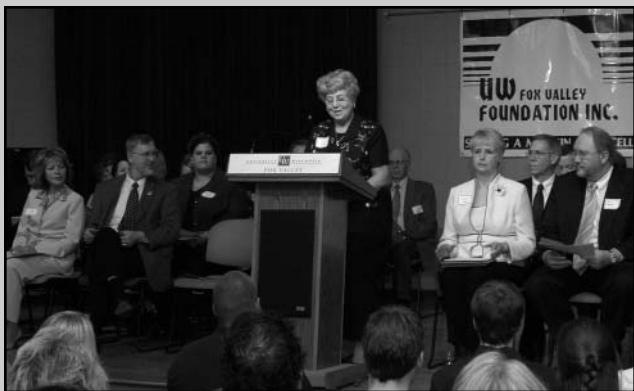
UW-Fox Valley Foundation Executive Director addresses the audience on "Scholar's Evening."