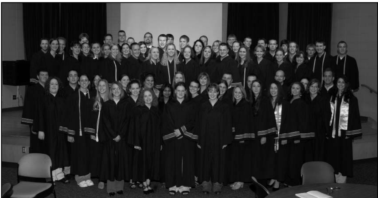
UWFox graduates who took part in the 2005 Commencement Ceremony.