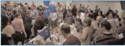
The e.a.t.s. fundraising event helps support educational scholarships for students enrolled at UW-Fox Valley and has raised nearly $210,000 since its inception in 1997.

The ninth annual e.a.t.s. (educational assistance through scholarships) fundraising event will be hosted at UW-Fox Valley on October 15, 2005, from 6:00 to 9:00 p.m. Approximately 50 community chefs, volunteers, UW-Fox Valley faculty, staff and students will come together to host a delectable event. Guests are invited to sample a wide array of hors d'oeuvres, entrées, desserts and complimenting wines and beers as they wind their way through the specially appointed halls of the university. Jazz, classical and vocal musical entertainment is offered throughout the evening, and a distinctive collection of items is showcased in a silent auction.